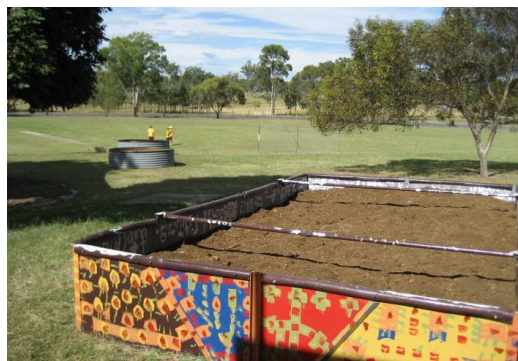
Above: The Biggenden garden when it first began several years ago. Below and left: And today! Look how it's grown!

The staff and students at Biggenden State School really do love their permaculture garden! The garden has literally 'grown' beyond belief and this year, they also won a Stephan Alexander grant to extend the garden and build a kitchen. Another innovative outcome is the sale of parsley to the local Biggenden Butcher. What a great idea!