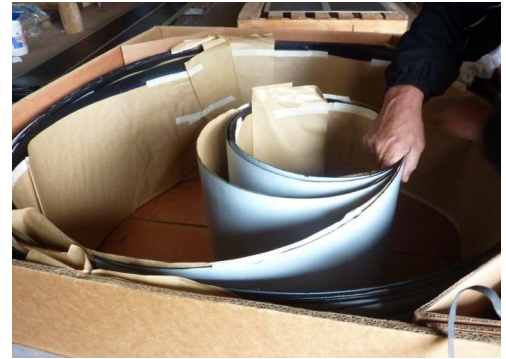
Above: The flexible, lightweight silicon cells are unpacked, ready for installation. Below: The SKYShades solar cell installation will power machinery in the Crumpton's peanut processing shed as well as feed electricity back into the grid.

For further information about thin film flexible PV solar cells, please contact Bob Weller at SKYShades at bobandrobyn@skyshades.com.au or phone 4162 5138.